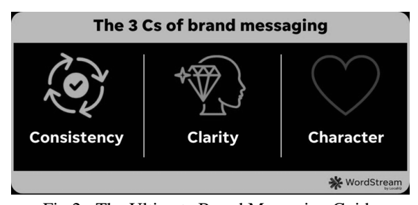
Fig 2: The Ultimate Brand Messaging Guide

Brand messaging involves the language, tone, and voice used by a content creator to communicate with their audience. Effective brand messaging should convey the creator's values, personality, and unique selling propositions (USPs). Consistent and clear messaging helps to establish trust and credibility. It ensures that all communications align with the brand's identity and values, making it easier for audiences to understand and connect with the creator's mission and vision (Lair, Sullivan, & Cheney, 2005). 77% of shoppers are more likely to buy from brands that personalize their shopping experience, and 86% of shoppers prefer an authentic and honest brand personality on social media (Lauren 2023).