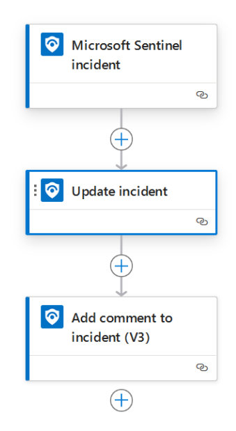
Figure 9 depicts the Logic apps workflow. The workflow details the orchestrated playbook. The Logic apps playbook allows us to configure and automate when the conditions are met in the set analytics rules.