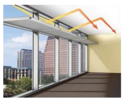
Fig 2: Showing light shelf concept.

Light shelves are natural lighting apparatuses mounted on windows that reflect natural light from the outside onto the ceiling surface of an indoor room. This design reduces the amount of energy required for lighting while mitigating the issues of glare and illumination imbalance that arise from direct external natural light exposure. To optimize the performance of a light shelf, the height, width, angle, and material of the shelf are variables that require adequate control. Light shelves are commonly used in high-rise and low-rise office buildings, as well as institutional buildings, on the side of the building facing the equator to maximize sunlight exposure (Clifford, 2022)