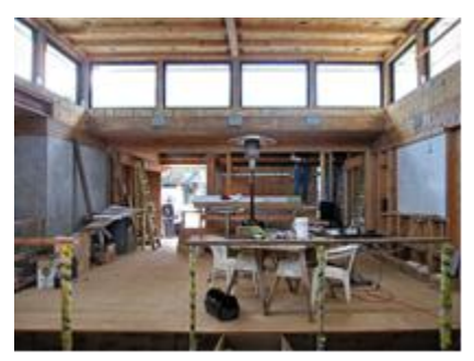
Fig 3: Showing Clerestory Windows.

provide a direct light path to polar-side (north in the northern hemisphere; south in the southern hemisphere) rooms that otherwise would not be illuminated. Alternatively, clerestories can be used to admit diffuse daylight (from the north in the northern hemisphere) that evenly illuminates a space (Clifford, 2022).