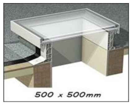
Fig 1: Showing Image of the skylight.

Skylights are known for their ability to provide a visual connection between the indoor and outdoor environment, which can enhance the overall aesthetic appeal of a building. They also offer sustainable building practices by reducing the need for artificial lighting during the day, thus saving energy. Additionally, skylights can improve indoor air quality by providing ventilation, which can prevent the buildup of moisture and harmful pollutants Overall, skylights are a cost-effective and eco-friendly solution for any building, which can add both aesthetic and functional value (Ander, 2016).