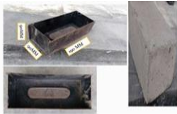
Production of Fly ash Bricks