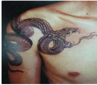
Temptation, knowledge, and wisdom