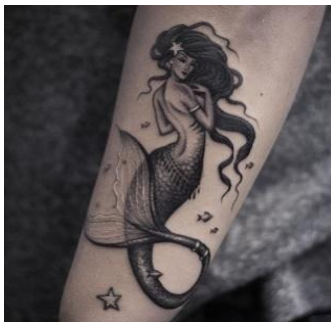
Temptation, seduction, materialism