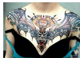
Longevity, happiness, mystery