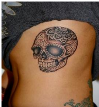
Courage, Death, Poison