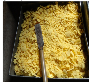
Fig. 3: Corn Starch