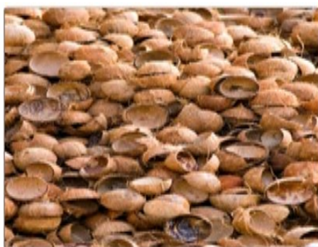
Fig. 1: Coconut Husk

Coconut husk was prepared by treating of coconut husk concentrated sulphuric acid and keeping it in an oven at 150° C for 24 hrs. The carbonized material was scour with distilled water to unfasten free acid and dried in oven.