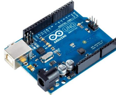
Fig. Arduino UNO

The Atmel AVR® core combines a rich instruction set with 32 general purpose working registers. All the 32 registers are directly connected to the Arithmetic Logic Unit (ALU), 5= two independent registers to be accessed in a single instruction executed in one clock cycle. The resulting architecture is more code efficient while achieving throughputs up to ten times faster than conventional CISC microcontrollers.