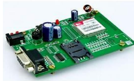
Fig. GSM Module

GSM/GPRS Modem-RS232 is built with Dual Band GSM/GPRS engine- SIM900A, works on frequencies 900/ 1800 MHz's The Modem is coming with RS232 interface, which allows you connect PC as well as microcontroller with RS232 Chip (MAX232). The baud rate is configurable from 9600-115200 through AT command. The GSM/GPRS Modem is having internal TCP/IP stack to enable you to connect with internet via GPRS. It is suitable for SMS, Voice as well as DATA transfer application in M2M interface. The onboard Regulated Power supply allows you to connect wide range unregulated power supply. Using