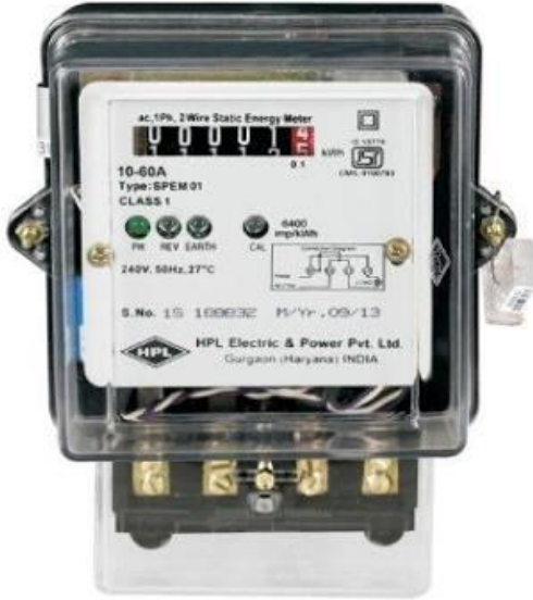
Fig. Energy Meter

Power meters are sometimes referred to a energy meters and vice versa. Per definition, (active) power is a measure of what is required (or consumed) in order to perform useful work. For example, a light bulb with a 100W rating consumes 100 watts of active power in order to create light (and heat). Energy, per definition, is the measure of how much work has been required over a known period of time. In the light bulb example, leaving the bulb on for an hour it will consume 100W \times 3600s = 360000Ws (watt-seconds) = 100Wh (watt-hours) = 0.1kWh (kilowatt-hours) of energy.